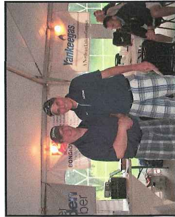
Team Jor-Mad: 2012 Boardman Cup Champs