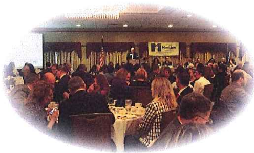
Over 200 Chamber members and guests attended the annual meeting and a wonderful time was had by all!